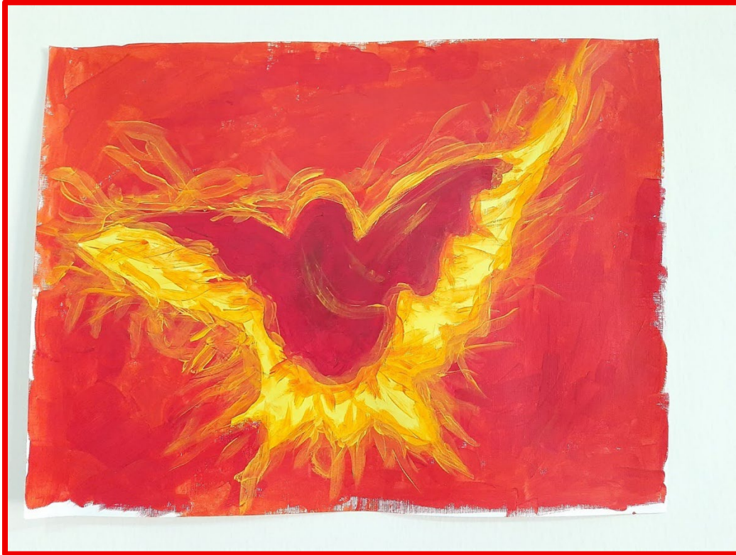
Teo Contreras, The Descent of the Holy Spirit (acrylic, 2019)

The Church of the Holy Spirit (Episcopal)