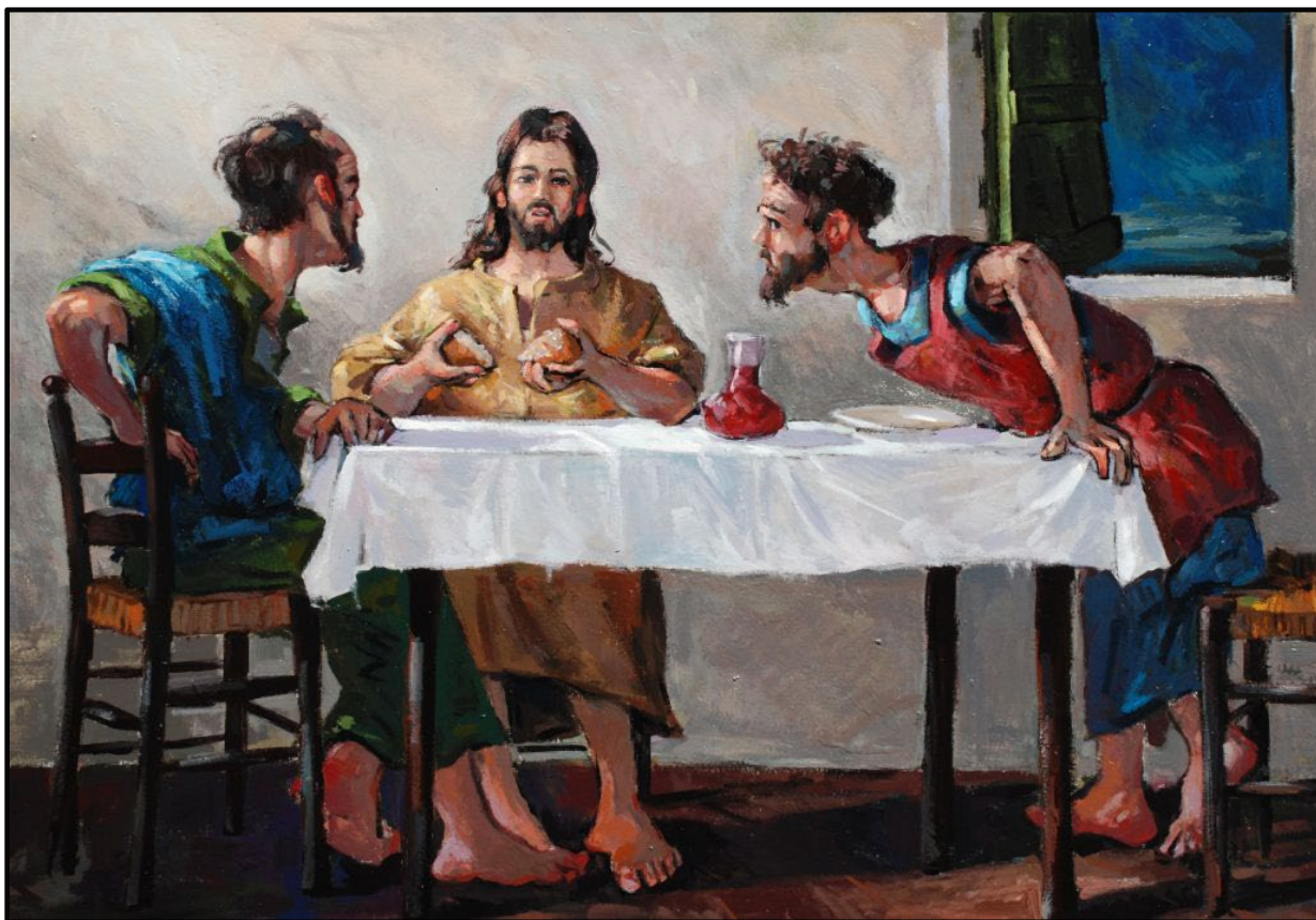
The Supper at Emmaus by Davide Piubeni (Italian) 2004; used by permission

The Church of the Holy Spirit (Episcopal)