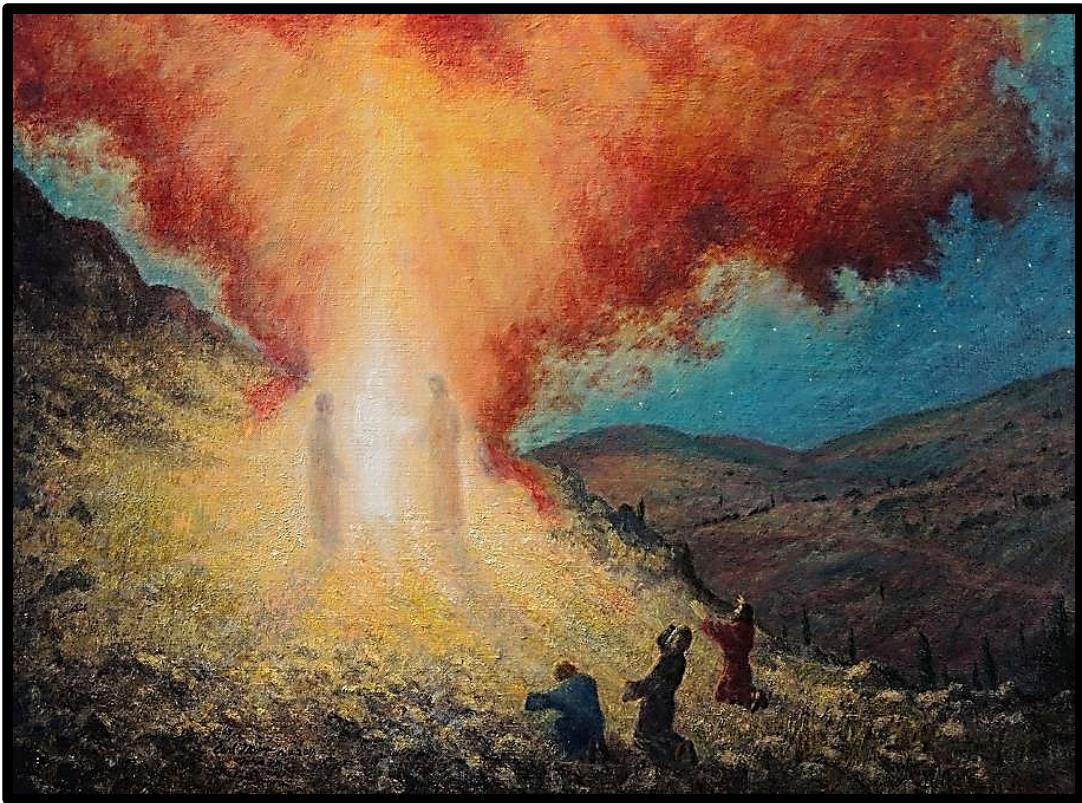
The Transfiguration of Christ by Earl Mott (American, 2016)

The Church of the Holy Spirit (Episcopal)